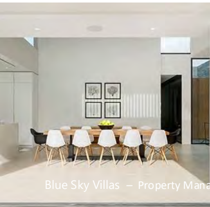
Blue Sky Villas – Property Management 2025

Blue Sky Villas have managed our property in Vale Verde for the past three years. During this time, they have proved that not only are they competent in managing high-worth properties but also being able to manage demanding guests by being quick to solve problems and by exceeding their expectations.